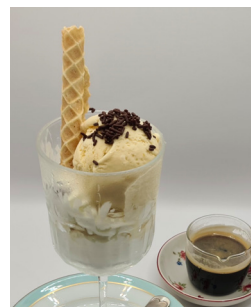
Vienna iced coffee