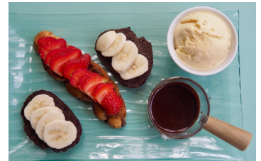
Black & white French toast