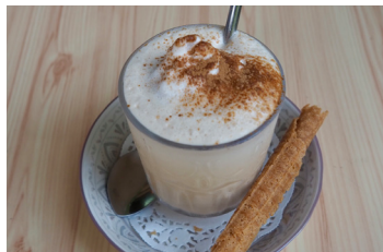
Iced chai latte

A beautiful globe amaranth flower rises from a marigold blossom, Mao Feng green tea leaves and jasmine buds.