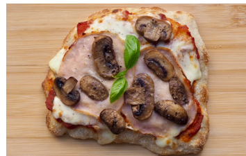
Pinsa Prosciutto & Funghi