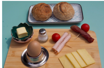
The hearty Swiss