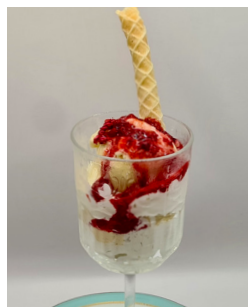
Coupe Heisse Liebe