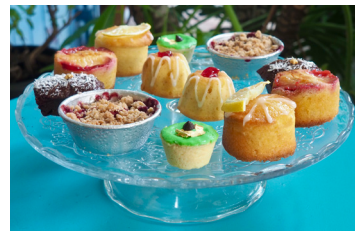
High tea set