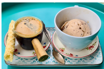
Affogato al Stracciatella

A double espresso served with a scoop of our home-made Stracciatella ice cream.