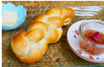
The simple Swiss