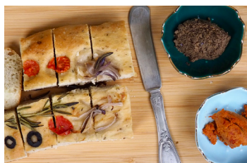
Focaccia & dip

Lettuce and cherry tomatoes topped with toasted sesame & pumpkin seeds, olive oil, Balsamic vinegar and a dash of Harissa.